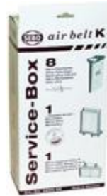
Service Box #6695AM