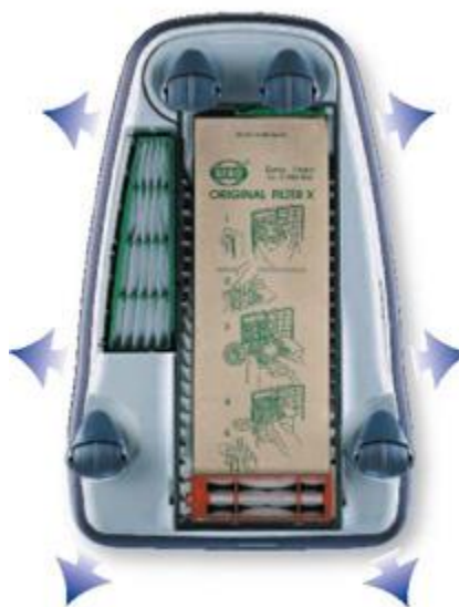
AIRBELT C3.1 and C2.1