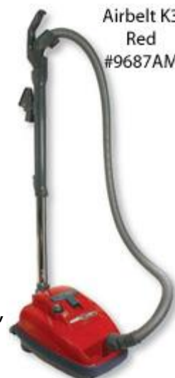
Airbelt K3 Red #9687AM

The Sebo Airbelt K3 and K2 are considered mid-size canister vacuums, which means they are small or compact machines. They offer one mid-size and two full-size on-board attachments, a .8-gallon filter bag, an operating range of 32 feet, and the K-model canisters weigh four pounds less than Sebo's C-model