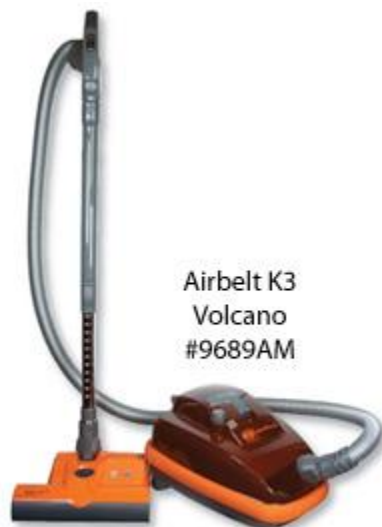
Airbelt K3 Volcano #9689AM