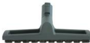
Parquet Brush #6391DA