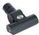
Hand-held Turbo Brush #6179DA