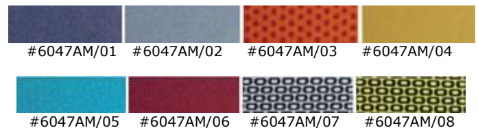
#6047AM/01 #6047AM/02 #6047AM/03 #6047AM/04

The AIRBELT C and K canisters can be personalized with a replacement AIRBELT bumper cover, available in the following eight patterns and colors.