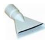
Flat Upholstery Nozzle #1090HG