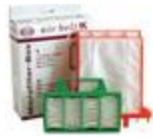
Microfilter Set #6696AM