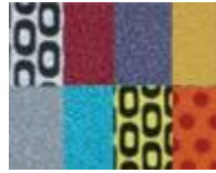
Airbelt Covers 8 Choices #6047AM/01 to 08