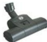
TT-C Turbo Brush #6780ER (K2 Hunter Green Only)