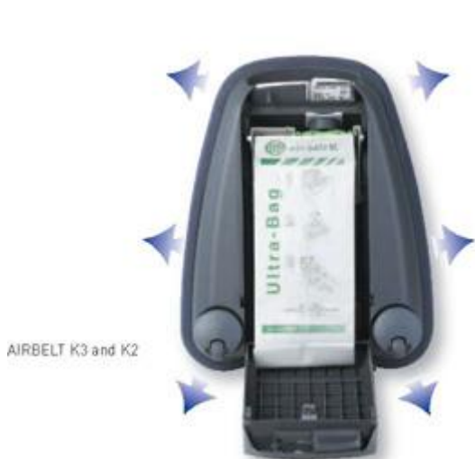
AIRBELT K3 and K2