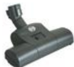
TT-C Turbo Brush #6780ER