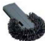
Radiator Brush #1496DG