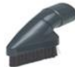
Dusting Brush #1387DG