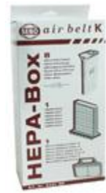
HEPA Service Box #6431ER