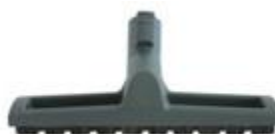
Parquet Brush #6391DA